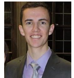
Jack Ryan 1663