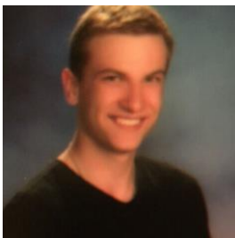
Sean Donlon 1649